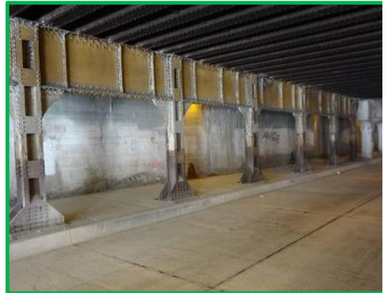
1530 S. Racine - after