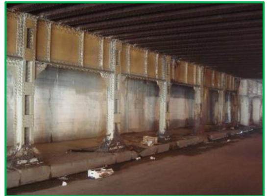
1530 S. Racine (UP and BNSF) –before